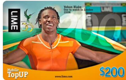
Yohan Blake 100m, 200m and 4x100m relay Jamaica