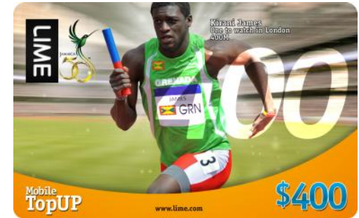
Kirani James 400m Grenada